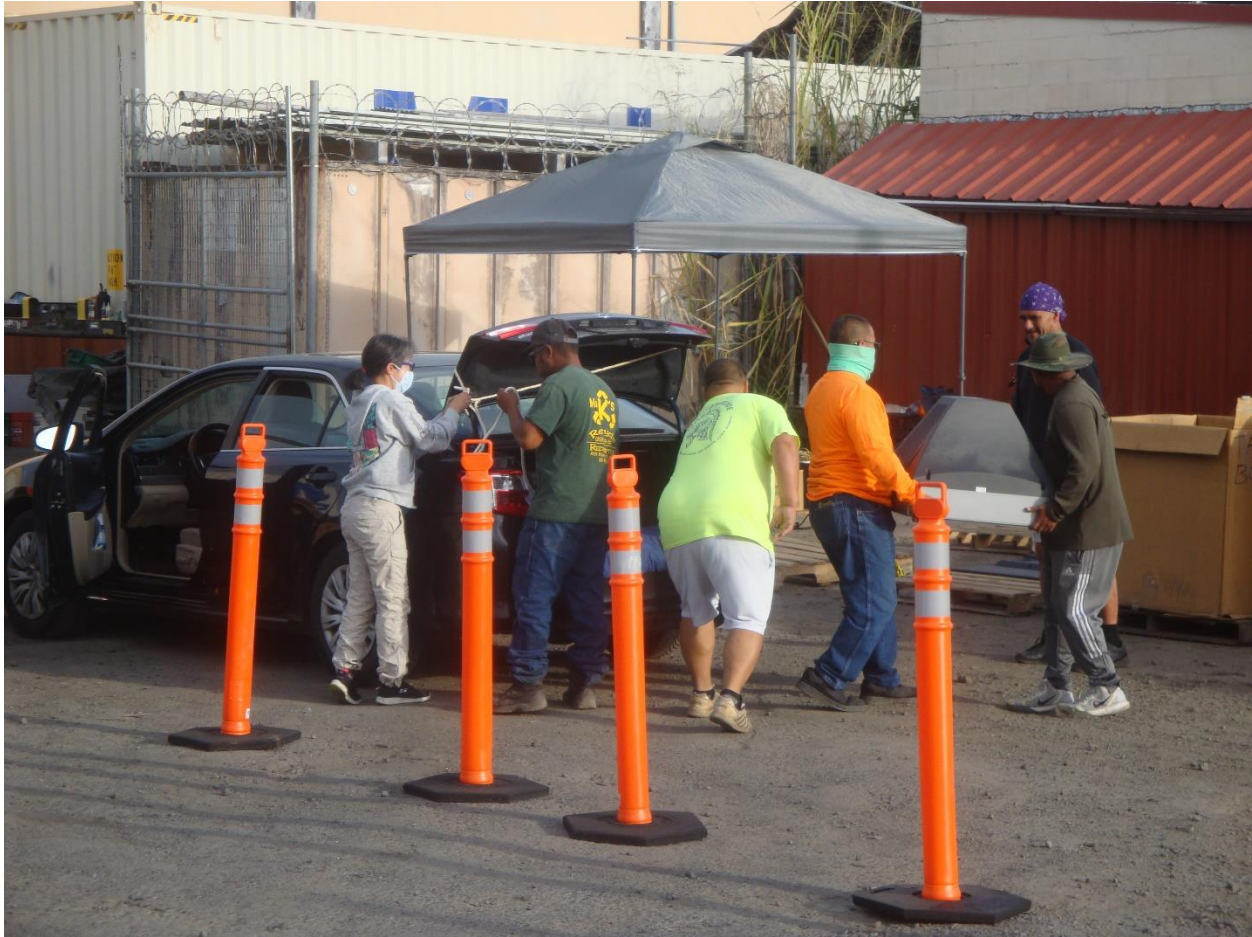
Photo caption: Mr. K's Recycle & Redemption employees collect electronics from a customer at the Hilo Electronics Recycling Collection Event on January 14, 2023.