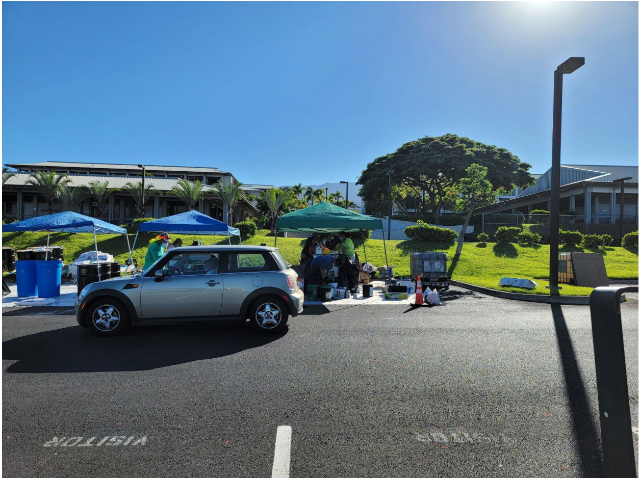
Photo caption: EnviroServices & Training Center collects HHW from a customer at the Kona Household Hazardous Waste Collection Event on August 14, 2021.