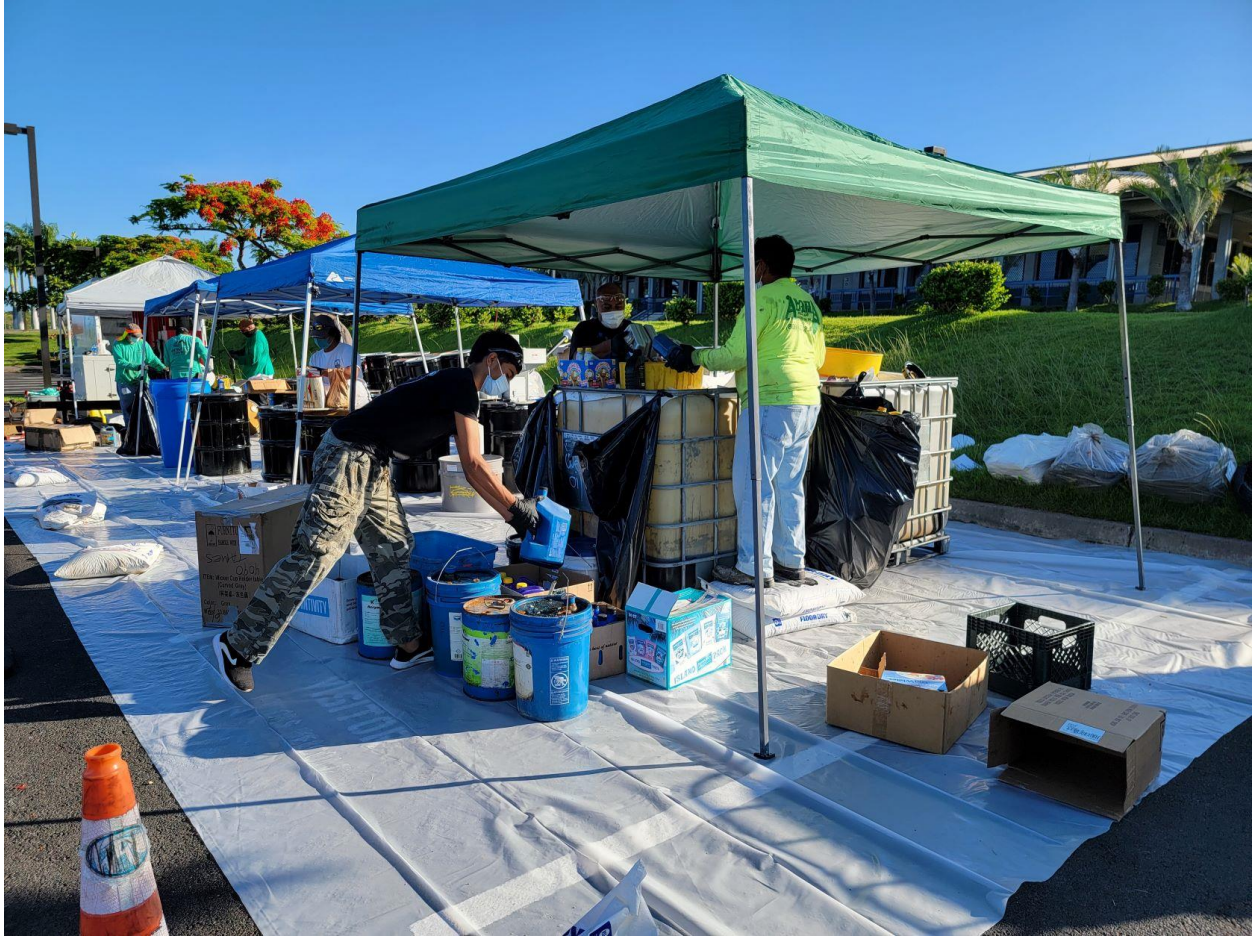
Photo caption: EnviroServices & Training Center consolidating HHW at the Kona Household Hazardous Waste Collection Event on August 14, 2021.